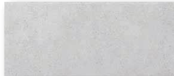
Hall's bathroom pavement