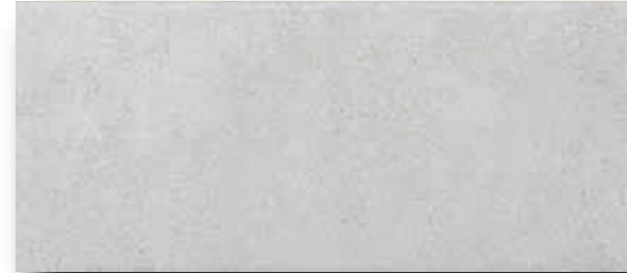
Main bathroom pavement